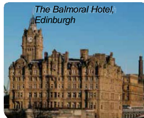
The Balmoral Hotel, Edinburgh