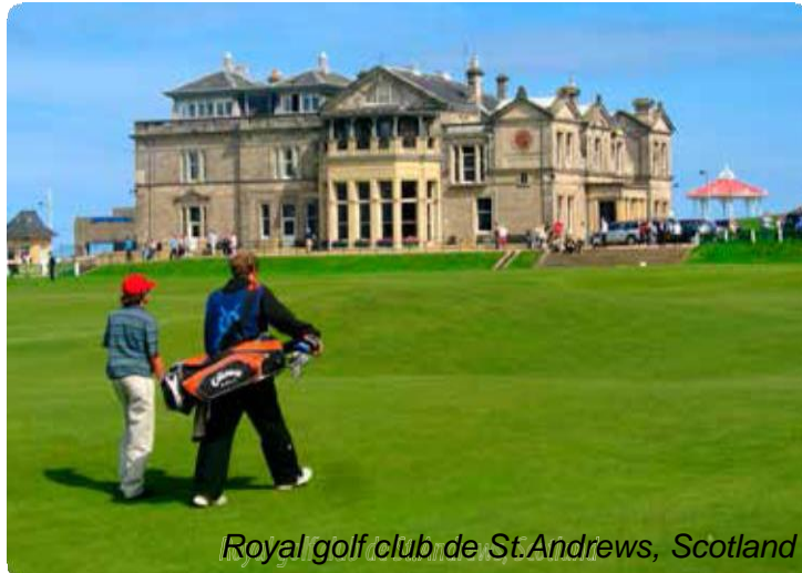
Royal golf club de St. Andrews, Scotland