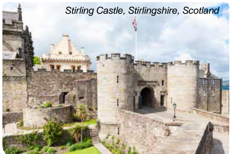
Stirling Castle, Stirlingshire, Scotland