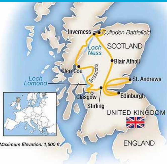
Maximum Elevation: 1,500 ft.