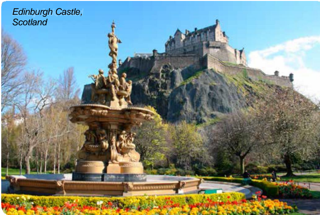
Edinburgh Castle, Scotland